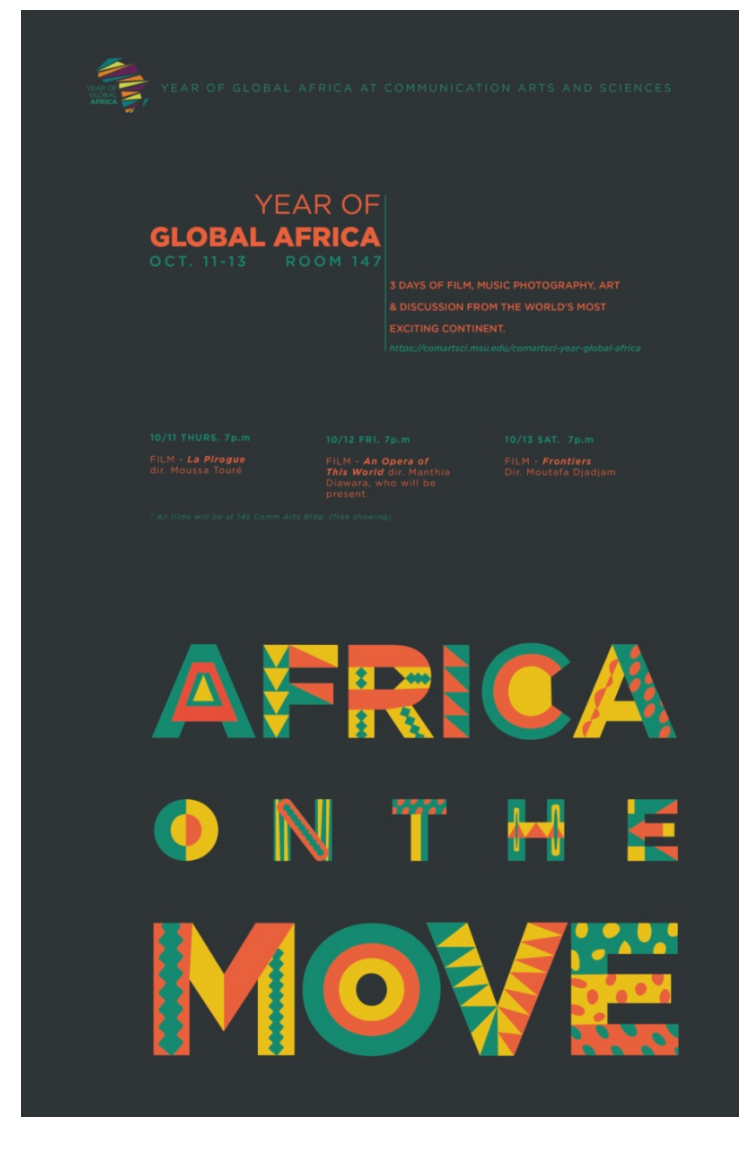
See following post for film details and showtimes.